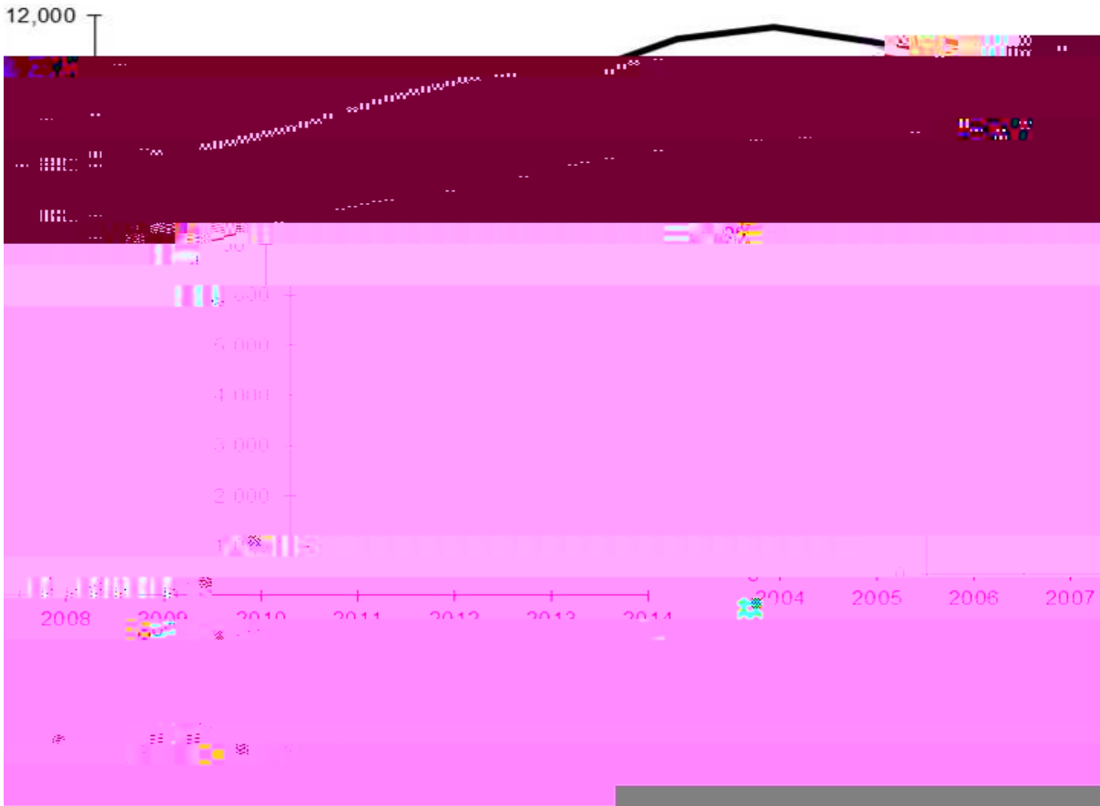
Table 2. Degrees Conferred By Level, ...